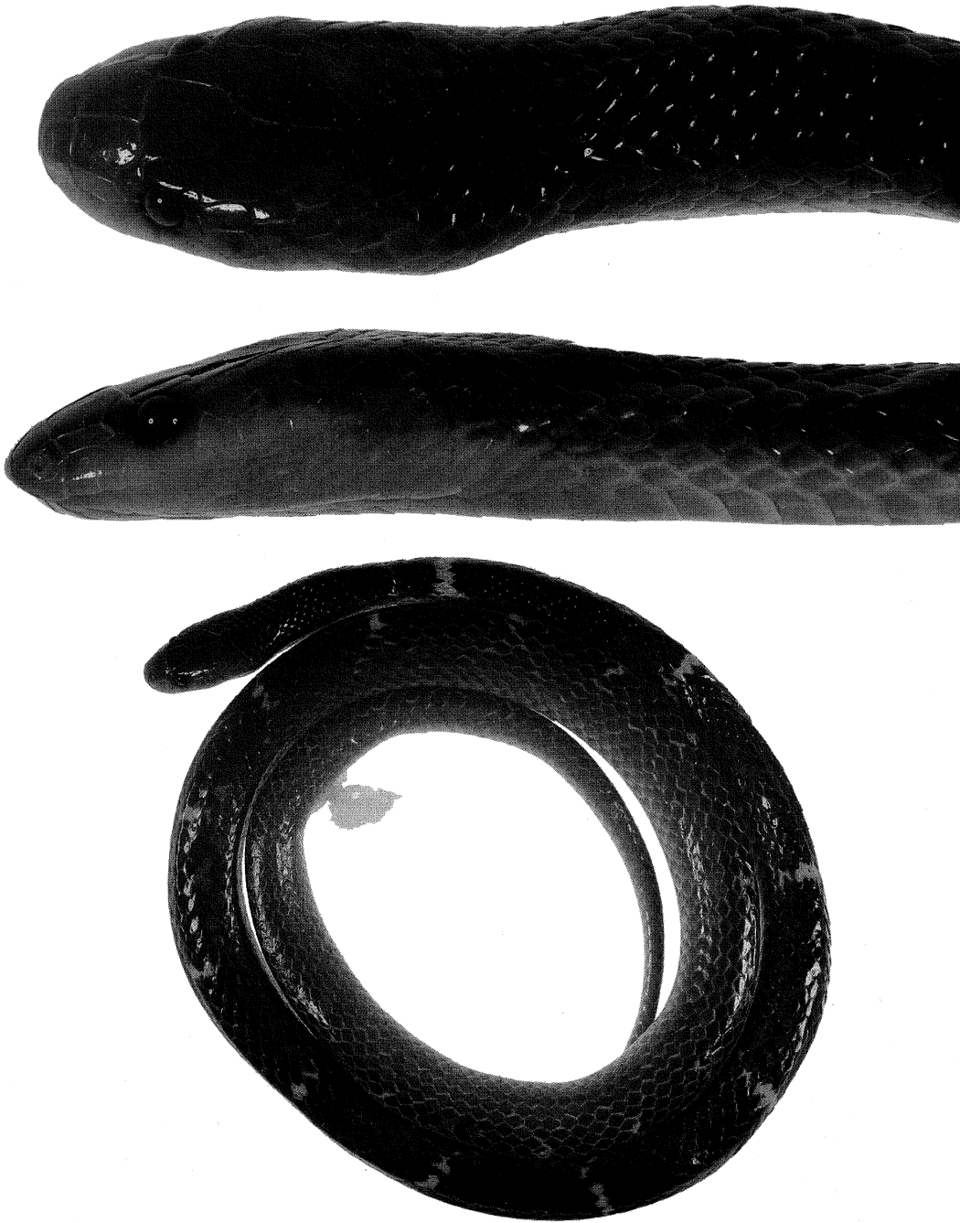
FIGURE 1. The holotype (CAS 210323) of Lycodon zawi .