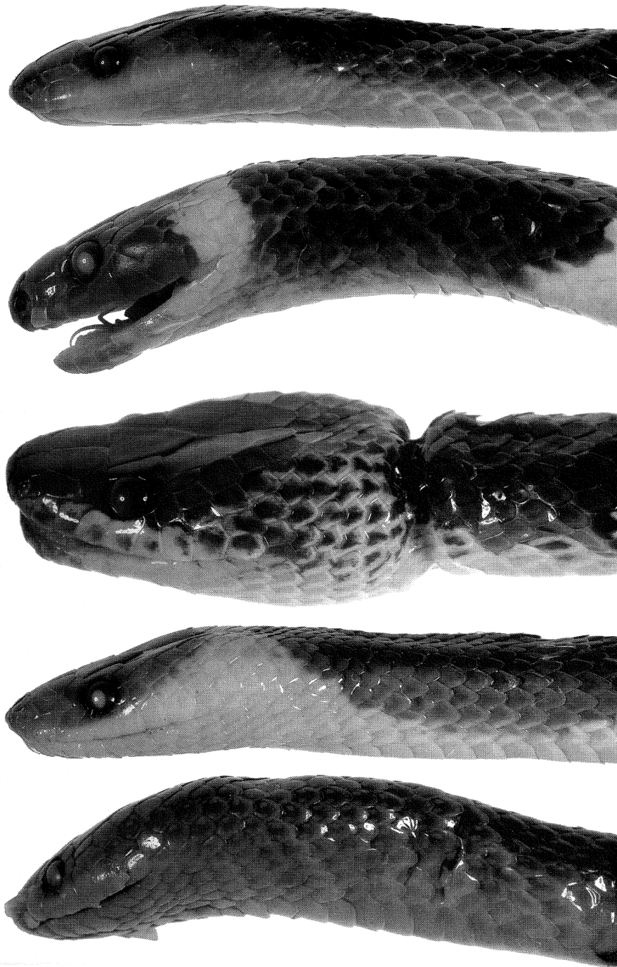
FIGURE 3. Lateral views of heads of (top to bottom; same snakes as in Fig. 2) Lycodon zawi , L. fasciatus , L. aulicus , L. laoensis , and L. jara .