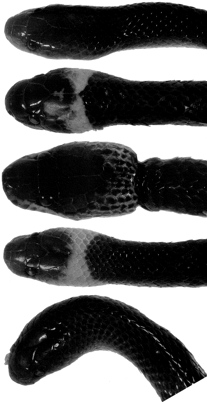
FIGURE 2. Dorsal views of heads of (top to bottom) Lycodon zawi (CAS 210323), Lycodon fasciatus (CAS 55147) from western China, L. aulicus (CAS 216278) from Mandalay Division, Myanmar, L. laoensis (CAS 73679) from Thailand, and L. jara (CAS 12395) from Assam, India.