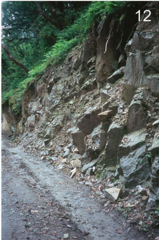
FIGURES 11–12. Photographs of habitat for Aristochroa abrupta sp. nov., eastern slope of the Gaoligong Shan, Gongshan County, western Yunnan Province, China. Fig. 10. Forest in valley of Qiqi He at No. 12 Bridge Camp, 16.3 km W of Gongshan, 2775 m; adult beetles collected mainly in pitfall traps placed on the forest floor in this habitat (at locations marked by pink flagging tape in photograph). Fig. 11. Type locality, valley of Danzhu He, 13.5 km SW of Gongshan, 2380 m; adult beetles collected at night along road cut near or on large granitic boulders.