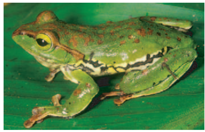
FIGURE 2. From a color transparency of \it Rhacophorus\ taronensis\ (MBM-JBS\ 11793) .

VARIATION.— Further observations were made on specimens newly collected from Myanmar. On several specimens (CAS 224370-224371, 224382, 224397, MBM-JBS 11793; Joseph B. Slowinski field number to be deposited in the MBM) the spotting on the flanks is white, more reticulate, and continues onto the ventral surface (Fig. 2). The brown spotting on the back may be very extensive (CAS 224371, 224377, MBM-JBS 11793) (Fig. 2) or absent (CAS 224369–224370, 224379).