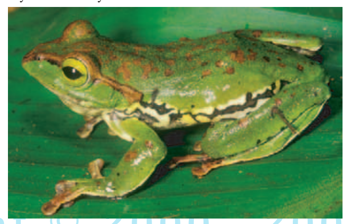
FIGURE 2. From a color transparency of Rhacophorus taronensis (MBM-JBS 11793).

VARIATION.— Further observations were made on specimens newly collected from Myanmar. On several specimens (CAS 224370-224371, 224382, 224397, MBM-JBS 11793; Joseph B. Slowinski field number to be deposited in the MBM) the spotting on the flanks is white, more reticulate, and continues onto the ventral surface (Fig. 2). The brown spotting on the back may be very extensive (CAS 224371, 224377, MBM-JBS 11793) (Fig. 2) or absent (CAS 224369–224370, 224379).