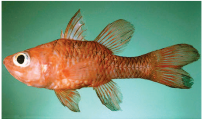
FIGURE 3. Fresh color of holotype of Apogon rubifuscus , BPBM 39346.

posterior pupil margin and posterior orbit edge; upper jaw length 2.0 in head; mouth slightly oblique, the gape forming an angle of about 40^\circ to horizontal axis of body; supramaxilla not present; a band of villiform teeth in jaws (maximum of about 12 rows in upper jaw and five in lower jaw); a single row of about 17 very small, conical teeth on palatine; small conical teeth forming a V-shaped patch on vomer, two rows anteriorly and two rows posteriorly (vomerine teeth larger than those in jaws). Anterior part of tongue slender and spatulate. Largest gill raker at angle and adjacent to angle on lower limb, its length one-third eye diameter.