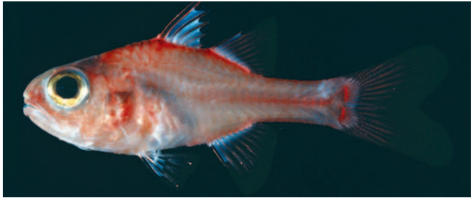
FIGURE 2. Fresh color of paratype of Apogon kautamea , BPBM 6635.

14.5 (14.2–16.6: 15.3). Fifth dorsal-fin spine length 10.2 (9.4–11.7: 10.6). Sixth dorsal-fin spine length 5.2 (4.7–7.0: 5.9). Length spine of second dorsal fin 14.1 (13.2–14.8: 14.0). Longest dorsal ray (1–3, usually 3 rd ) 21.9 (21.4–24.0: 22.5). First anal-fin spine length 4.6 (3.6–4.9: 4.2). Second anal-fin spine length 12.9 (11.8–13.2: 12.8). Longest anal ray (1–3, usually 2 nd ) 21.1 (18.9–23.9: 22.1). Upper caudal-fin lobe length 32.5 (32.1–35.8: 34.3). Lower caudal-fin lobe length 29.1 (29.1–39.2: 32.8).