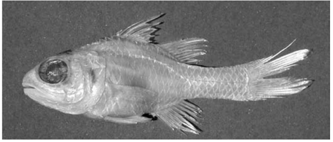
FIGURE 1. Holotype of Apogon kautamea , CAS 219899.

Snout length 7.3 (5.8–8.7: 7.2). Bony interorbital width 9.3 (8.1–9.4: 8.9). Upper jaw length 20.4 (19.7–21.8: 20.7). Caudal peduncle depth 13.7 (11.5–14.2: 13.1). Caudal peduncle length 31.3 (27.9–31.8: 30.2). First dorsal-fin base length 15.9 (15.0–17.5: 15.9). Second dorsal-fin base length 15.2 (14.1–15.9: 14.7). Anal-fin base length 16.1 (13.2–16.3: 15.2). Pectoral-fin length 24.8 (23.7–29.7: 26.6). Pelvic-fin length 26.8 (23.6–28.8: 26.0). First dorsal-fin spine length 5.0 (4.8–7.6: 5.9). Second dorsal-fin spine length 22.9 (21.6–24.1: 22.8). Third dorsal-fin spine length 17.7 (17.5–20.3: 18.9). Fourth dorsal-fin spine length