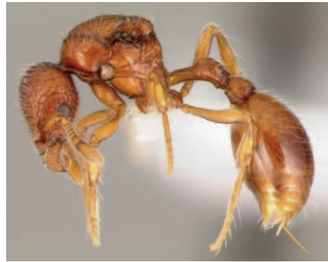
FIGURE 2. Image created using Synicoscopy Automontage software.

Renner and Ricklefs (1994) claim that systematists should not see themselves as “service providers”, for this will take away from the intellectual validity of the discipline and sap it of it