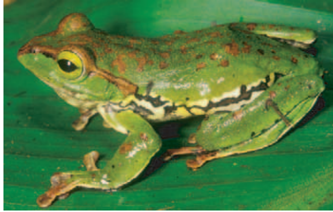
FIGURE 2. From a color transparency of Rhacophorus taronensis (MBM-JBS 11793).

VARIATION. — Further observations were made on specimens newly collected from Myanmar. On several specimens (CAS 224370–224371, 224382, 224397, MBM-JBS 11793; Joseph B. Slowinski field number to be deposited in the MBM) the spotting on the flanks is white, more reticulate, and continues onto the ventral surface (Fig. 2). The brown spotting on the back may be very extensive (CAS 224371, 224377, MBM-JBS 11793) (Fig. 2) or absent (CAS 224369–224370, 224379).