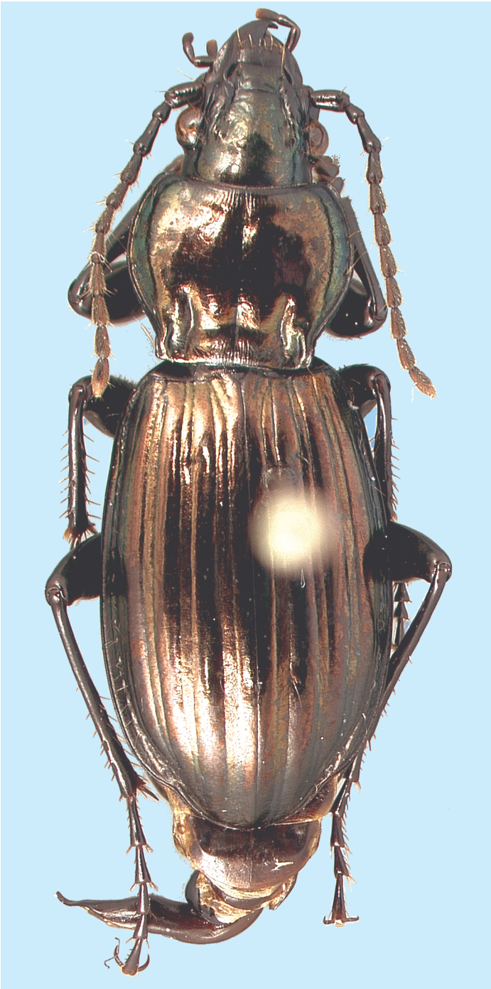
FIGURE 1. Digital photograph of habitus of holotype of Aristochroa abrupta sp. nov., dorsal aspect.

DIAGNOSIS. — Adults of A. abrupta sp. nov. can be distinguished from all other known species of Aristochroa by the following combination of character states: pronotum with lateral margins deeply and abruptly sinuate in posterior one-fifth, parallel anterior to base, with four (three or five in a few specimens) lateral setae anterior to middle, hind angles rectangular, basal foveae smooth, impunctate; pro-, meso-, and metepisterna smooth, impunctate; elytral interval 3 with two (one in a few specimens) discal setiferous pores; elytral intervals 1, 3, 5 and 7 strongly convex, microsculpture distinct on all intervals.