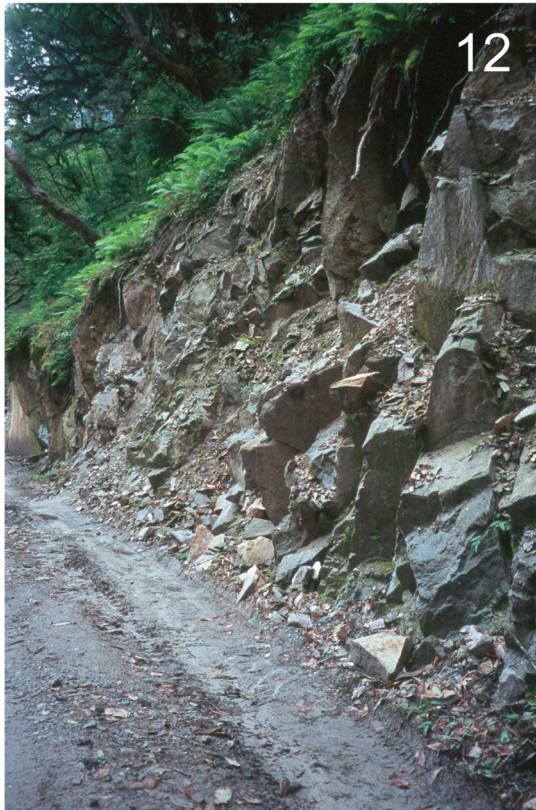
FIGURES 11–12. Photographs of habitat for Aristochroa abrupta sp. nov., eastern slope of the Gaoligong Shan, Gongshan County, western Yunnan Province, China. Fig. 10. Forest in valley of Qiqi He at No. 12 Bridge Camp, 16.3 km W of Gongshan, 2775 m; adult beetles collected mainly in pitfall traps placed on the forest floor in this habitat (at locations marked by pink flagging tape in photograph). Fig. 11. Type locality, valley of Danzhu He, 13.5 km SW of Gongshan, 2380 m; adult beetles collected at night along road cut near or on large granitic boulders.