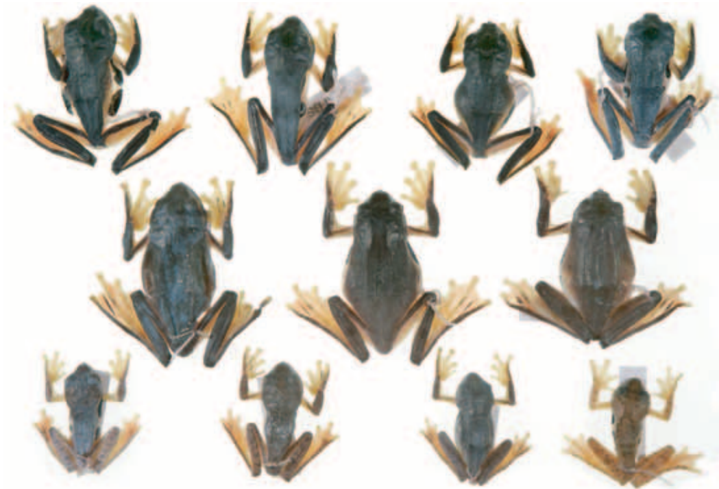
FIGURE 3. Dorsal view of representative specimens of Rhacophorus htunwini sp. nov. (top row), representative specimens of female R. bipunctatus (middle row), and representative specimens of male R. bipunctatus (bottom row).

the R. malabaricus species group ( R. calcadensis and R. malabaricus ), R. lateralis , R. pseudomalabaricus , and R. turpes by axillary spots.