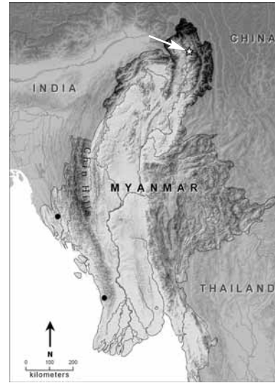
FIGURE 4. Distribution of Rhacophorus htunwini sp. nov. in Myanmar with type locality indicated by a star (at tip of arrow).

The type specimens including the holotype (CAS 229913, USNM 561869) were found approximately 2 m off the ground in bamboo. Referred specimens were found in undisturbed habitat near a spring (CAS 222136) or seasonal (CAS 221351) and permanent (CAS 222065) streams. Other species of Polypedates and Rhacophorus found in the vicinity of the type locality were P. leucomystax , R. bipunctatus , and R. dennysi .