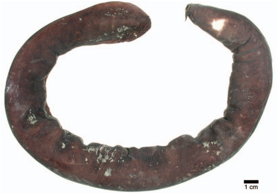
FIGURE 2. Left lateral view of preserved Eptatretus grouseri (CAS 201882; 420 mm TL).

number of unicusps on each row (6 vs. 8–10); total cusps (36 vs. 44–48); tail pores (88 vs. 71–79); shape of palatine tooth (triangular and depressed vs. conic [Fig. 3]); and its body coloration (pinkish-orange [Fig. 1] vs. dark brown [Fig. 2]). Also, the teeth of E. lakeside are more slender and more elongate than those of E. grouseri (Fig. 3). Eptatretus lakeside differs from E. profundus in the following characters, respectively (based on the redescription of the holotype of E. profundus